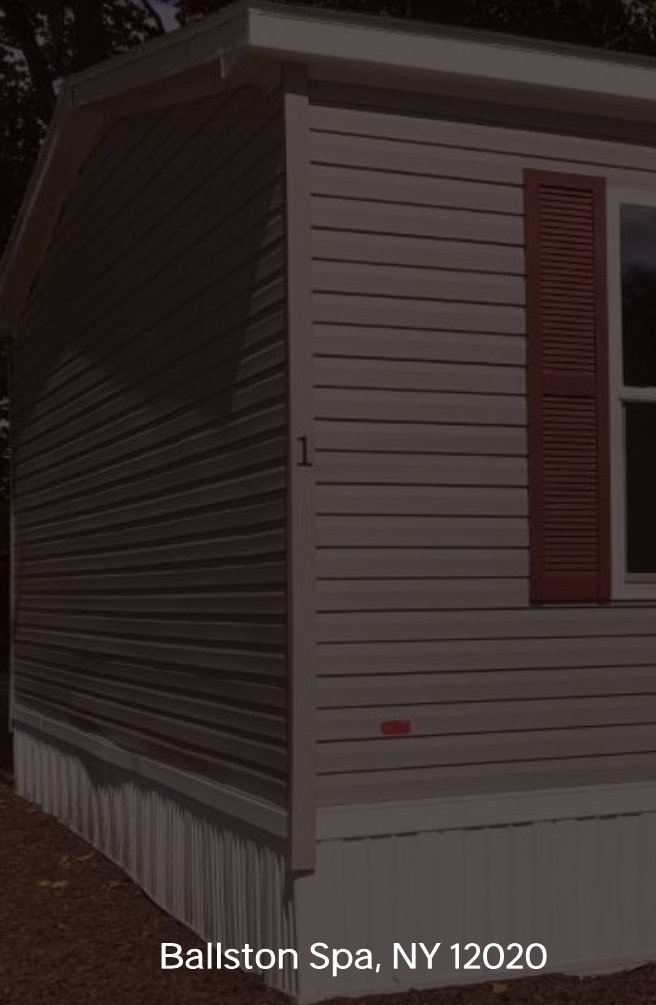
Ballston Spa, NY 12020